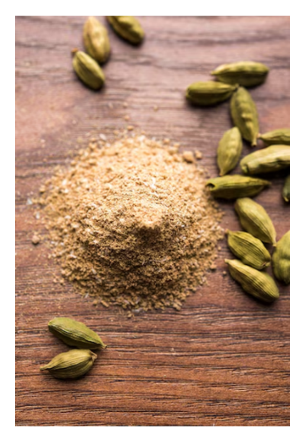
iZaG Cardamom Powder

Authentic Spice Blends, Pure and Powerful