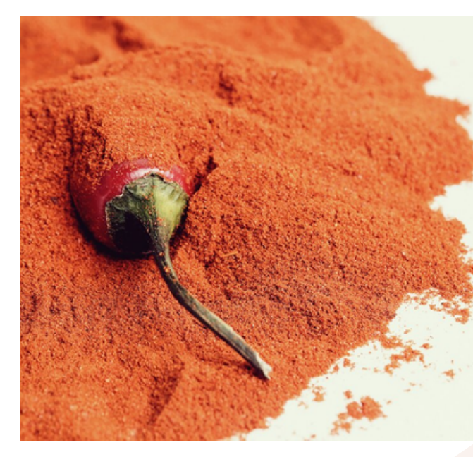
iZaG's Cayenne Pepper Powder

With a medium-hot heat level of 30,000-50,000 Scoville units, it's available in resealable pouches. Try sprinkling it on roasted vegetables, mixing it into marinades, or adding it to soups and stews for a spicy depth of flavor.